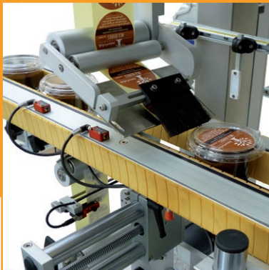
COMPACT TB-L conveyor module

Double unit LABELX JR 140 EW Swing applicator roll Double start photocell Double conveying module with flat belt COMPACT main frame in painted steel Double horizontal and vertical microregulation unit